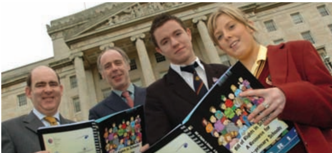
Launch of BORIS teaching resource.

A comprehensive education resource, Bill of Rights in Schools (BORIS): A Resource for Post-primary Schools , was formally launched on 8 February 2005 in Parliament Buildings, Belfast. The materials were developed through a partnership comprising the Commission, the Department of Education and all five Education and Library Boards. The new teaching resource was extensively piloted by teachers in 30 schools and distributed to all post-primary schools across Northern Ireland.