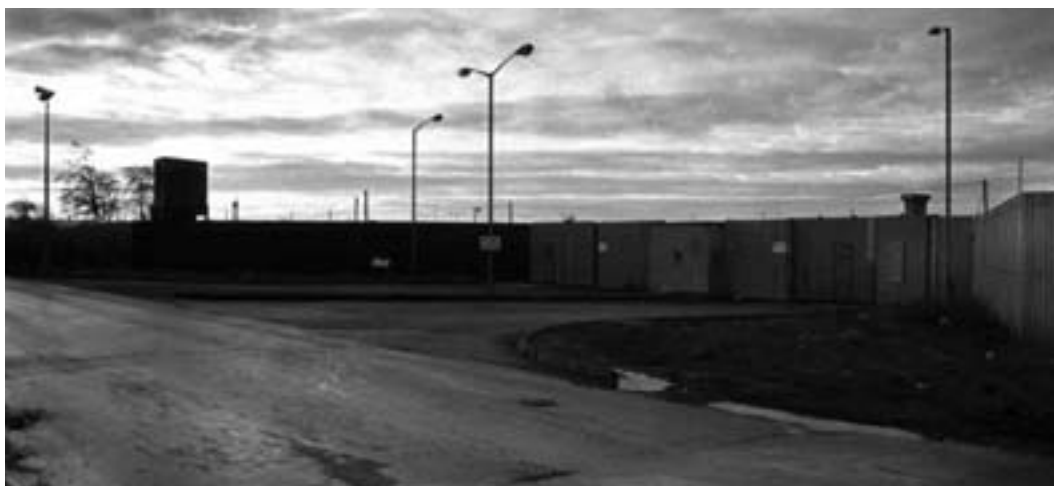
HMP Maghaberry.