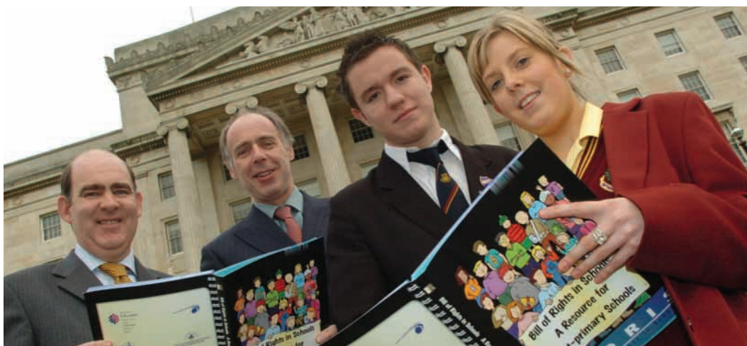
Launch of BORIS teaching resource.

A comprehensive education resource, Bill of Rights in Schools (BORIS): A Resource for Post-primary Schools , was formally launched on 8 February 2005 in Parliament Buildings, Belfast. The materials were developed through a partnership comprising the Commission, the Department of Education and all five Education and Library Boards. The new teaching resource was extensively piloted by teachers in 30 schools and distributed to all post-primary schools across Northern Ireland.