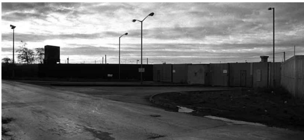
HMP Maghaberry.