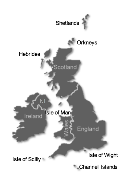
The Territory covered by the Common Travel Area

The Joint Committee of the Irish Human Rights and Equality Commission and the Northern Ireland Human Rights Commission commissioned this research paper to explore the nature of the CTA and to examine its legal impact within Ireland and the UK. Our research combined archival studies into the history of the CTA, legal research into the UK, Irish and EU legislation and case-law related to the CTA, and interviews and informal discussions with a range of stakeholders across government, public bodies and civil society in Ireland and the UK.